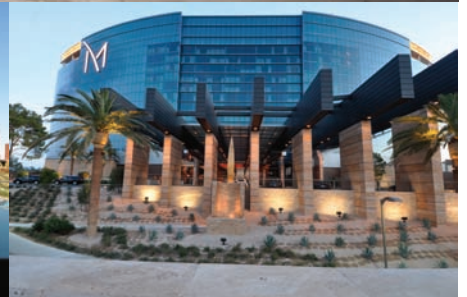
M Resort, Las Vegas, NV Design/Built by Marnell Corrao Associates