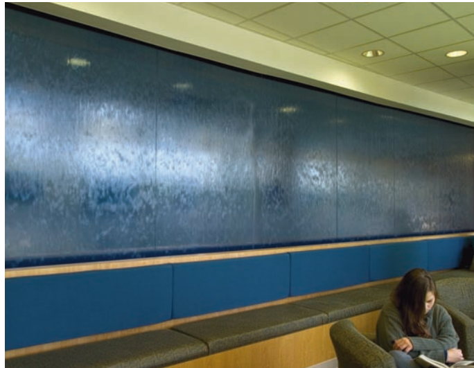
TOP: Water Wall Courtyard Greenwich, CT