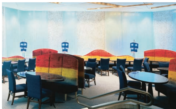
Gourmet Restaurant at Mohegan Sun, Uncasville, CT