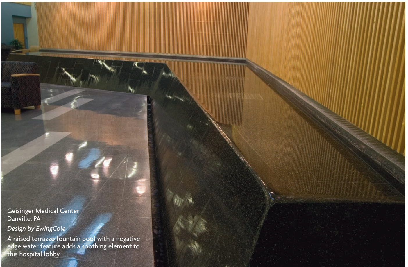
Geisinger Medical Center Danville, PA