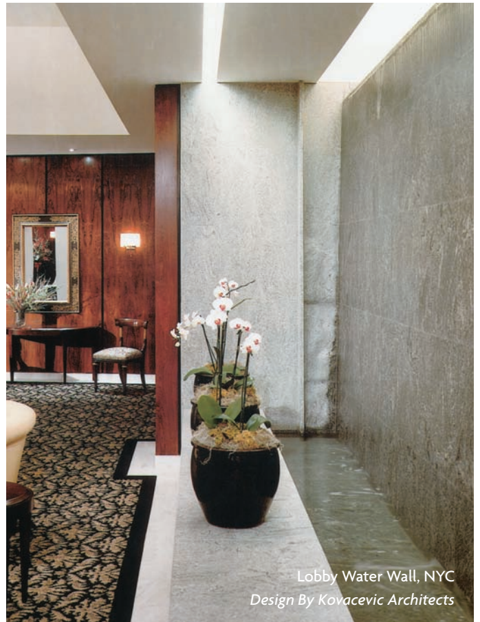
Lobby Water Wall, NYC Design By Kovacevic Architects

Textured slate stone adds excitement to this outdoor entry water wall. The agitated water display also helps to mask street noise at this NYC condominium building.