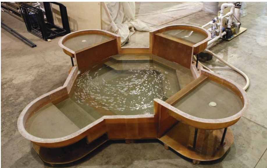
Below Left: Diagnostic factory test of a custom water feature with built-in equipment pack.