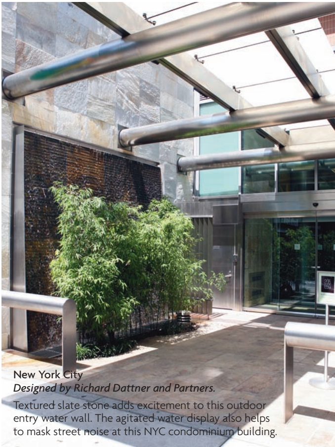
New York City Designed by Richard Dattner and Partners.

Textured slate stone adds excitement to this outdoor entry water wall. The agitated water display also helps to mask street noise at this NYC condominium building.