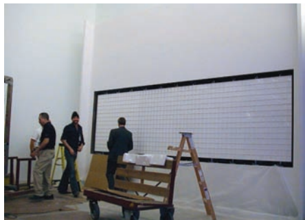
Above: Corporate Headquarters. Greenwich, CT